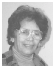
Illinois State Rep. Wyvetter Younge

► State Representative Wyvetter Younge introduced into the Illinois House of Representatives a resolution calling for the Federal Reserve to democratize access to productive credit. The resolution now resides in the House Rules Committee waiting for assignment in