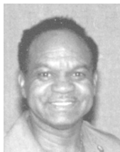
Rev. Walter Fauntroy

► The Hon. Rev. Walter Fauntroy , former D.C. delegate and chairman of the Congressional Black Caucus (CBC), delivered a powerful address before the Illinois Legislative Black Caucus, on April 26, 1997. Stressing the political, economic and spiritual